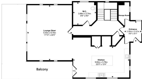
Ground Floor Approx 100 sq m / 1110 sq ft

Denotes head height below 1.5m This floorplan is only for illustrative purposes and is not to scale. Measurements of rooms, doors, windows, and any items are approximate and no responsibility is taken for any error, omission or mis-statement. Some of items such as bathroom suites are representations only and may not look like the real items. Made with Made Shabby 360.